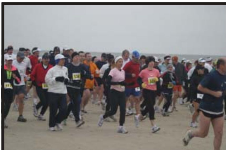
And away we go!

pack of half marathoners, who started the race simultaneously, helped each other by bearing the brunt of the wind so others could draft them.