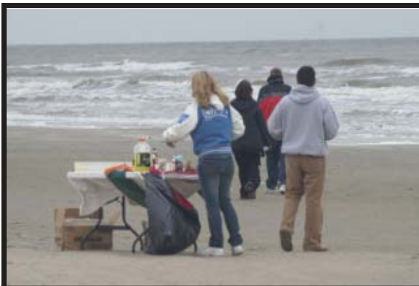
Brazoswood High School National Honor Society students braved the wind and chilly weather to do duty at the water stations.